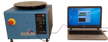
1281 with host PC