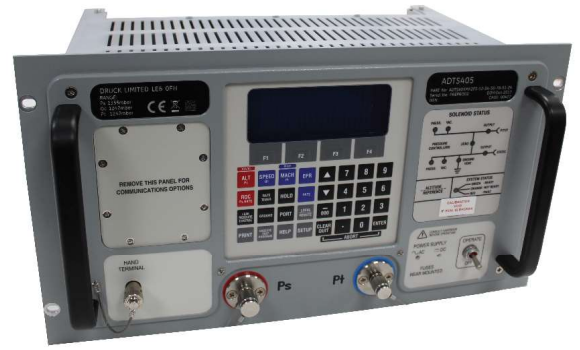
ADTS 405 Rack Mount

This is a self contained portable unit with integral pressure/ vacuum supplies, housed in a single military standard enclosure. It is ideal for calibration and simulation on the flightline.