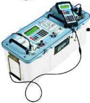
US Navy NSN 4920-01-656-6280