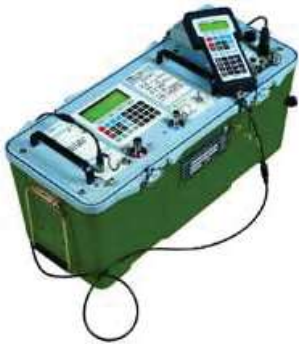
US Army NSN 4920-01-388-6790

Military authorities throughout the world have adopted the ADTS 405F variant as standard equipment such as: