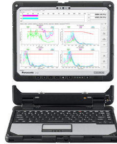
Laptop (in laptop carrying case) & Laptop Power Supply

Note: DAU power supply is enclosed in cover