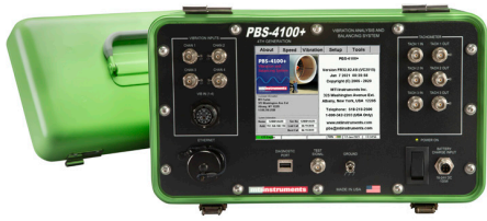
DAU (in DAU carrying case)

Note: DAU power supply is enclosed in cover