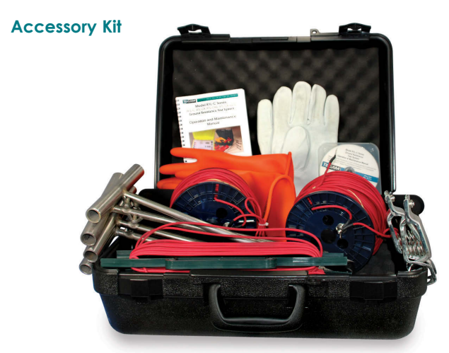
Ground Rods Included with R1L-C and CRA only Rods may be purchased separately for model R1L-CR

Readings are displayed on a 3.5 digit LCD display with decimal points. Indications are displayed for "low battery", "excessive stray current", "excessive current electrode resistance", and "excessive potential electrode resistance". Battery charging is indicated by an LED. A "Push to TEST" pushbutton turns on power and takes a reading. Range selection is automatic with "UP" and "DOWN" pushbuttons providing manual override by one range. Four five-way binding posts are used to connect the test leads. Two binding posts allow connection of the external DC source for field recharging.